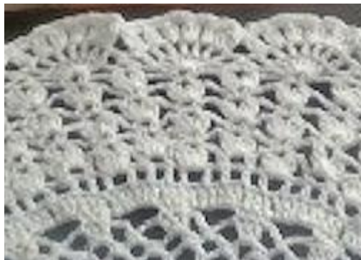
Row 26 sc in bobbles and 3sc in ch2 sp -- Image of edging.

Rnd 26: ch1, *sc in point of bobble, 3sc in ch2 sp*, repeat * to * around. Join. Finish off.